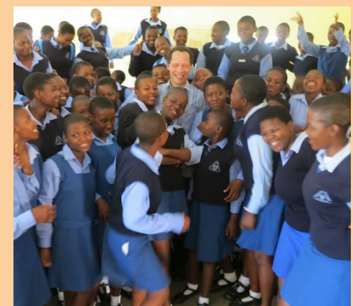
Lawrence Hill with girls' club members from Mpaka Railway Primary School.